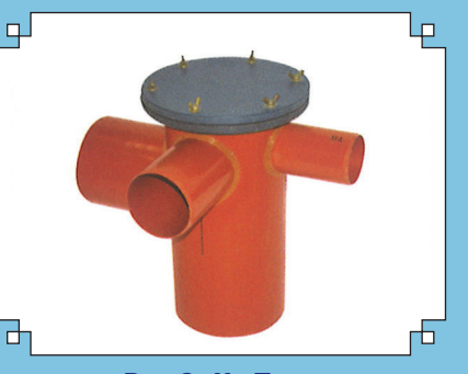
Dry Gully Trap