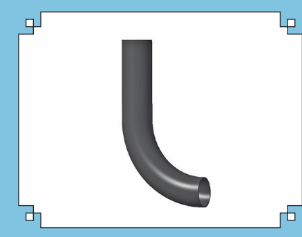
Duct Street Lighting Bends 3" / 4"