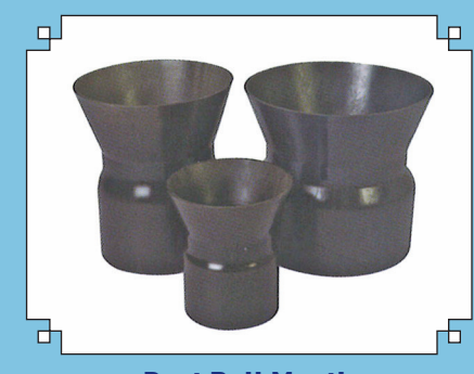
Duct Bell Mouth