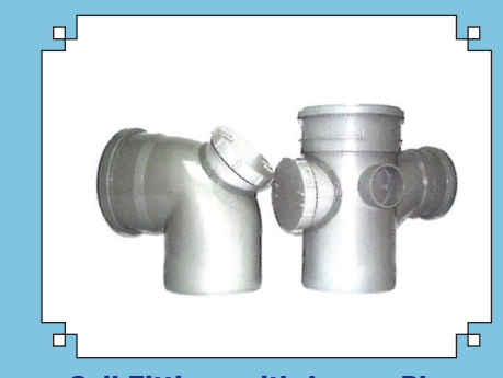
Soil Fittings with Access Plug