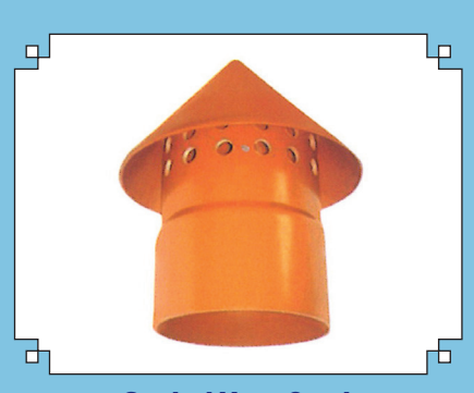
Sealed Vent Cowl