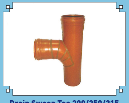
Drain Sweep Tee 200/250/315 mm