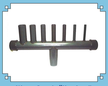
Water Supply "Headers"