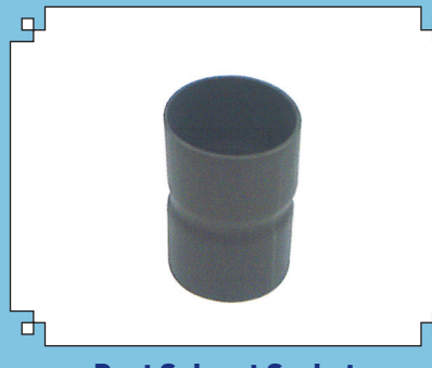
Duct Solvent Sockets 2"/3"/4"/6"/8"