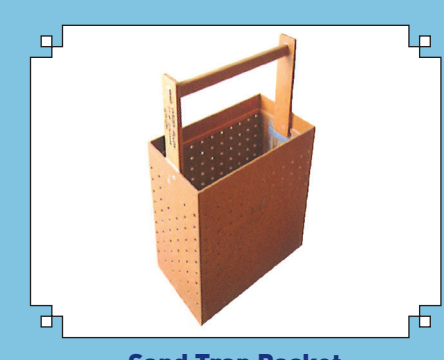
Sand Trap Basket

Modern Plastic Industry is a part of AL SHIRAWI GROUP OF COMPANIES. MPI was established in 1987 and has pioneered the manufacturing of UPVC Pressure & Drainage pipes & Fittings in the UAE. Today MPI has a wide range of SWR drainage, High pressure UPVC, CPVC, PP Compression Fittings and Pipes.