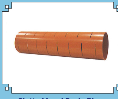
Slotted Land Drain Pipes 110 -400 mm