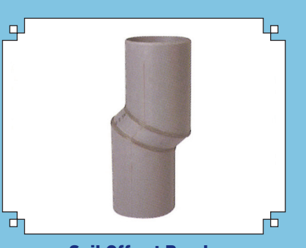
Soil Off set Bends