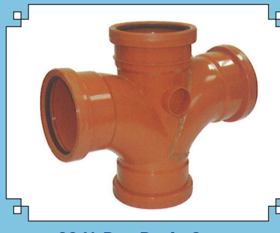
92 1/2 Deg Drain Cross