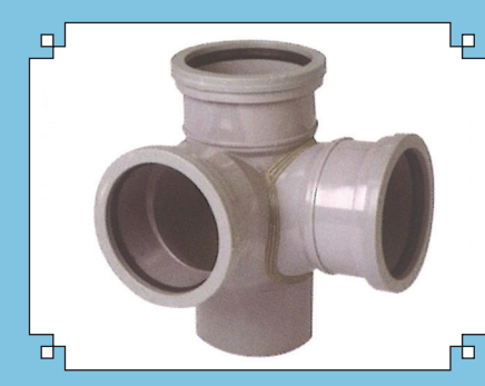
Soil Corner Branch