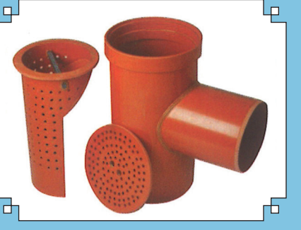
Gully Trap with Grating &Removable Basket