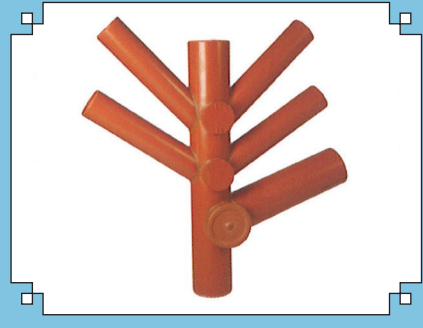
Sealed Dry manholes