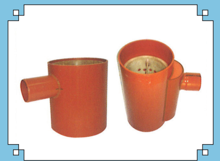
Catch Basin & Ramp Channel Gully as per DM specs