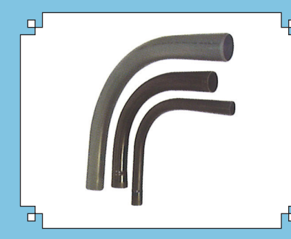
Duct Long Radius Bends