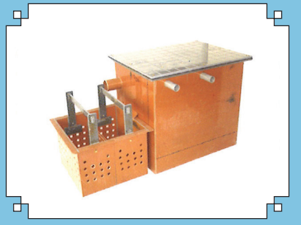
Grease Traps (Type A,B & C) DM Approved