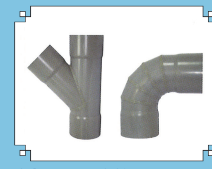
Soil Y Branch & 90 degree Elbow