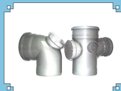
Soil Fittings with Access Plug