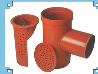
Gully Trap with Grating & Removable Basket