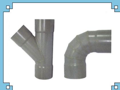
Soil Y Branch & 90 degree Elbow