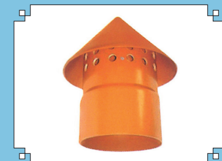
Sealed Vent Cowl