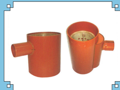
Catch Basin & Ramp Channel Gully as per DM specs