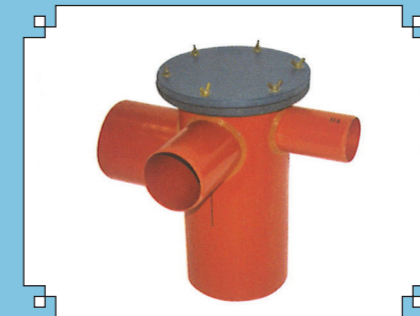
Dry Gully Trap