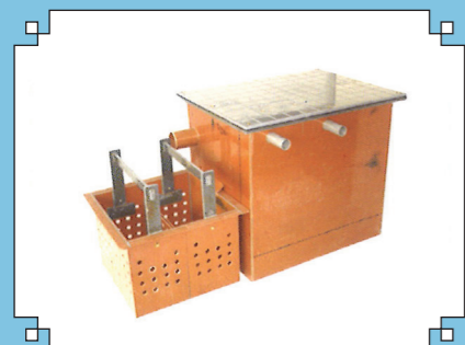
Grease Traps (Type A,B & C) DM Approved