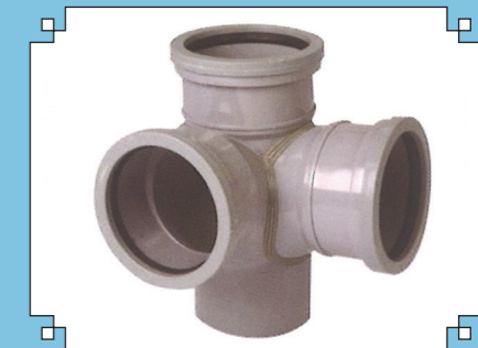
Soil Corner Branch