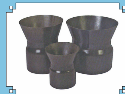
Duct Bell Mouth