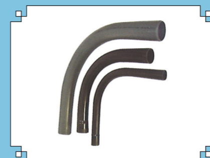
Duct Long Radius Bends