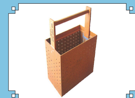
Sand Trap Basket

Modern Plastic Industry is a part of AL SHIRAWI GROUP OF COMPANIES. MPI was established in 1987 and has pioneered the manufacturing of UPVC Pressure & Drainage pipes & Fittings in the UAE. Today MPI has a wide range of SWR drainage, High pressure UPVC, CPVC, PP Compression Fittings and Pipes.