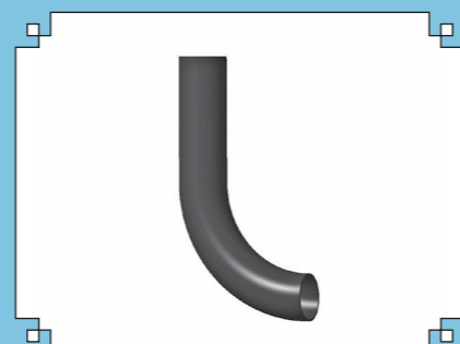
Duct Street Lighting Bends 3" / 4"