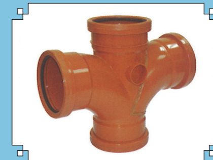
92 1/2 Deg Drain Cross