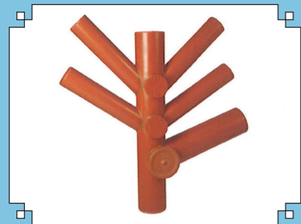
Sealed Dry manholes