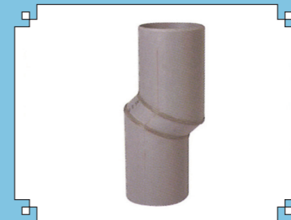
Soil Off set Bends