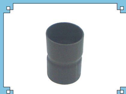
Duct Solvent Sockets 2"/3"/4"/6"/8"