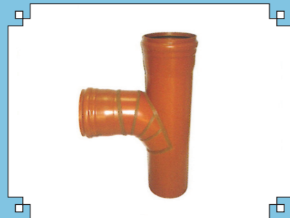
Drain Sweep Tee 200/250/315 mm