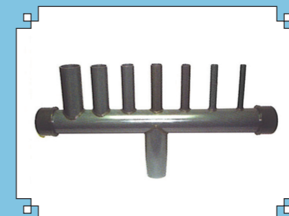
Water Supply "Headers"