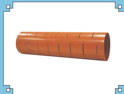
Slotted Land Drain Pipes 110 -400 mm